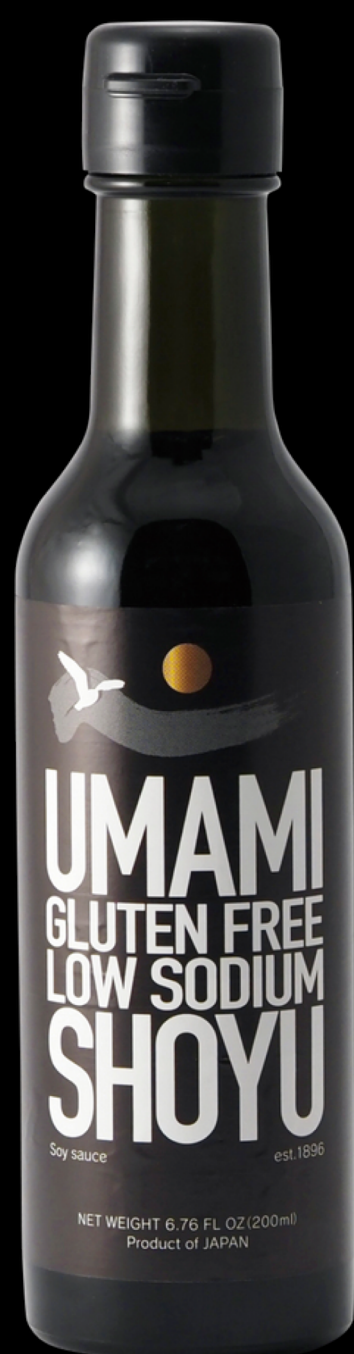
GLUTEN FREE LOW SODIUM